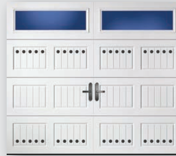
Handles & Clavos