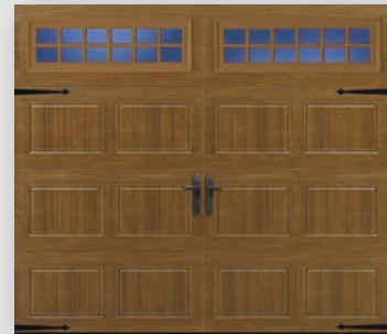
Handles & Hinges